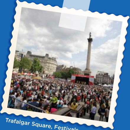
Trafalgar Square, Festivals