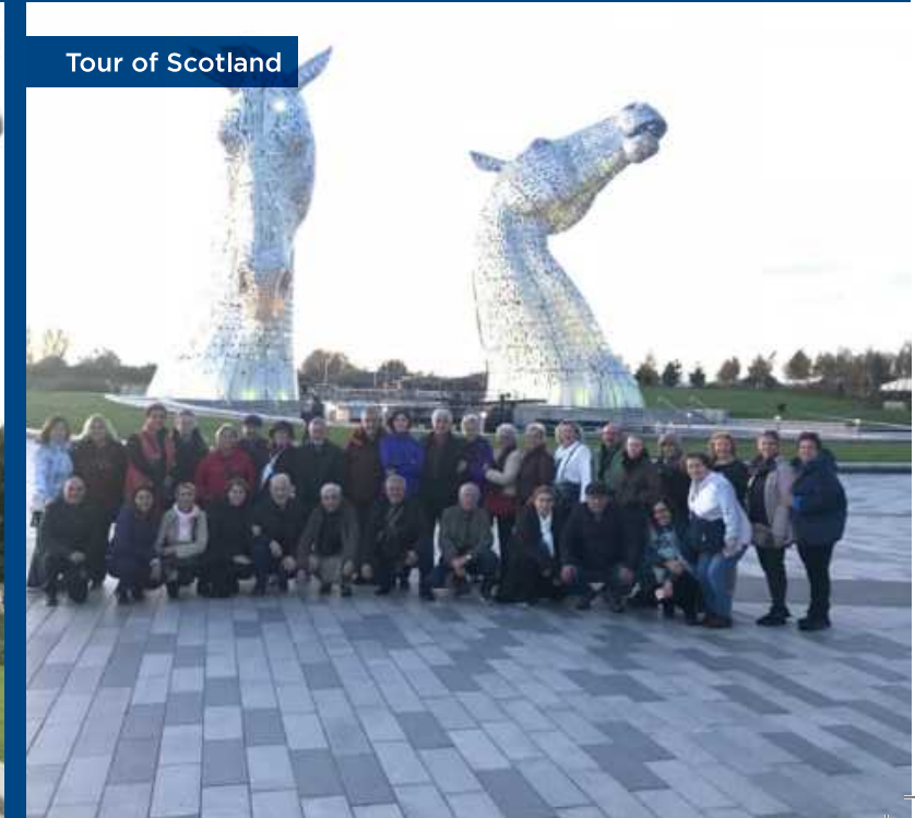
Tour of Scotland