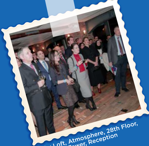
Sky Loft, Atmosphere, 28th Floor, Millbank Tower, Reception