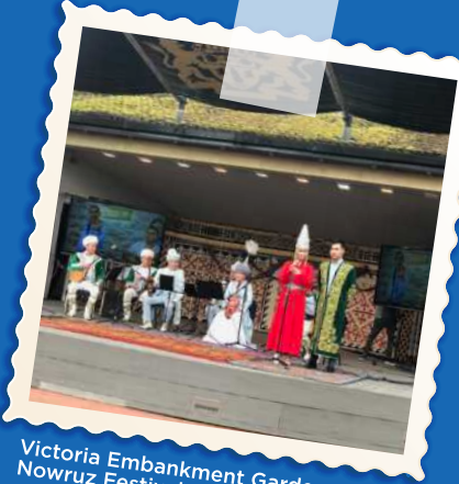
Victoria Embankment Gardens, Nowruz Festival