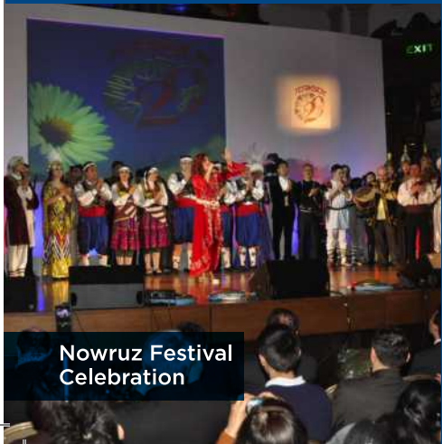
Nowruz Festival Celebration