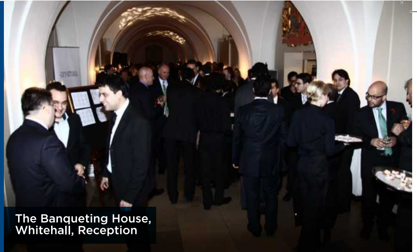
The Banqueting House, Whitehall, Reception