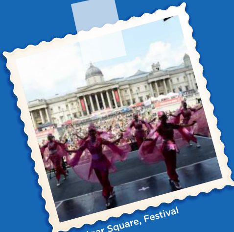
Trafalgar Square, Festival