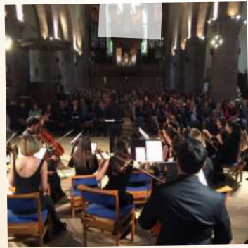
Greyfriars Kirk Edinburgh, Concert