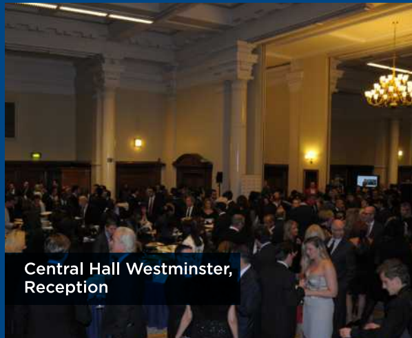
Central Hall Westminster, Reception