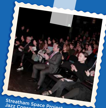
Streatam Space Project, Jazz Concert