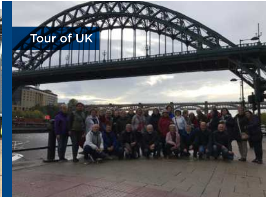
Tour of UK