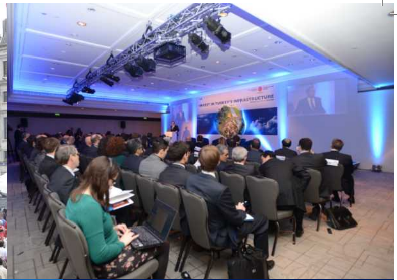
Intercontinental Park Lane Hotel, Conference