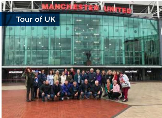
Tour of UK