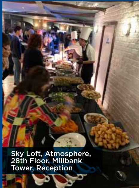
Sky Loft, Atmosphere, 28th Floor, Millbank Tower, Reception