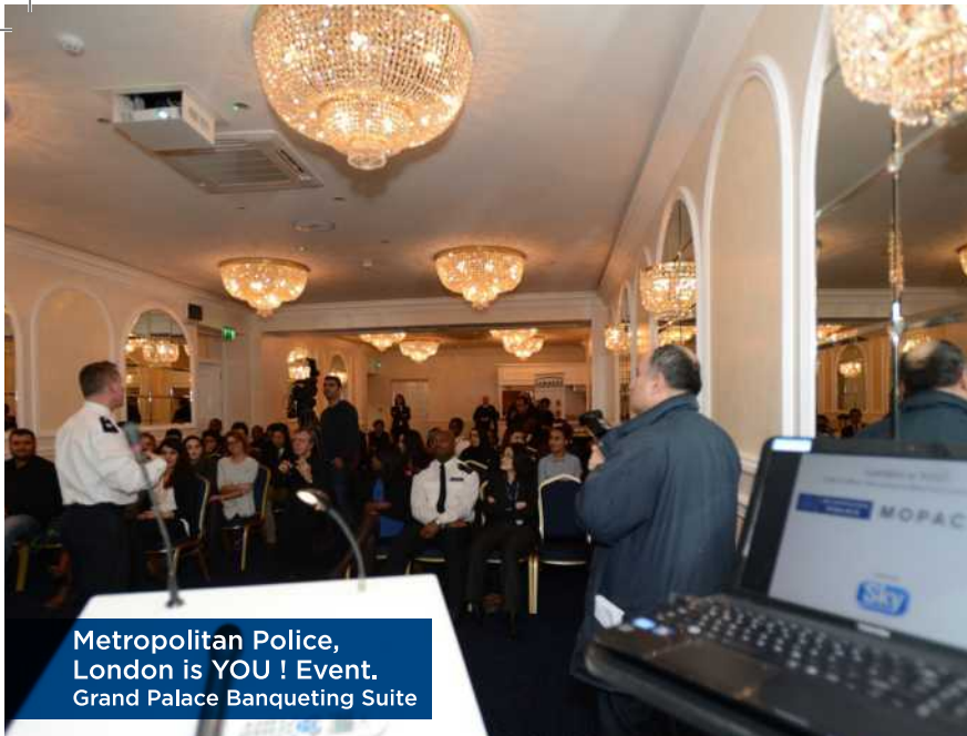
Metropolitan Police, London is YOU ! Event. Grand Palace Banqueting Suite