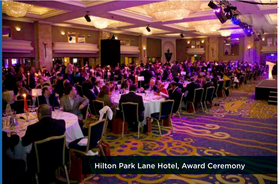
Hilton Park Lane Hotel, Award Ceremony

From Awards Ceremonies to Cultural Festivals, from reception to conference, Sky Management has designed more than a hundred events since 2011 alone.