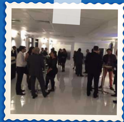
Altitude 360 , Atmosphere, 29th Floor, Millbank Tower, Reception