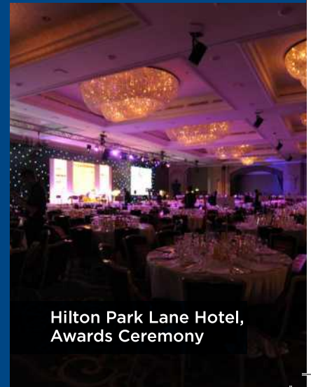
Hilton Park Lane Hotel, Awards Ceremony