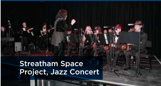
Streatham Space Project, Jazz Concert