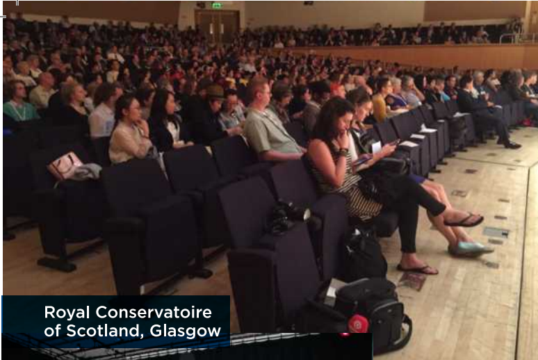
Royal Conservatoire of Scotland, Glasgow