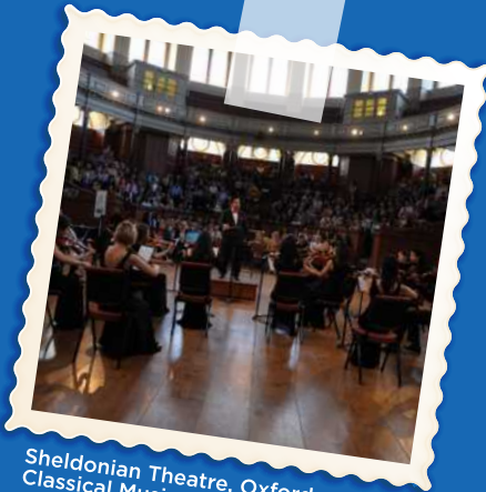
Sheldonian Theatre, Oxford, Classical Music Concert