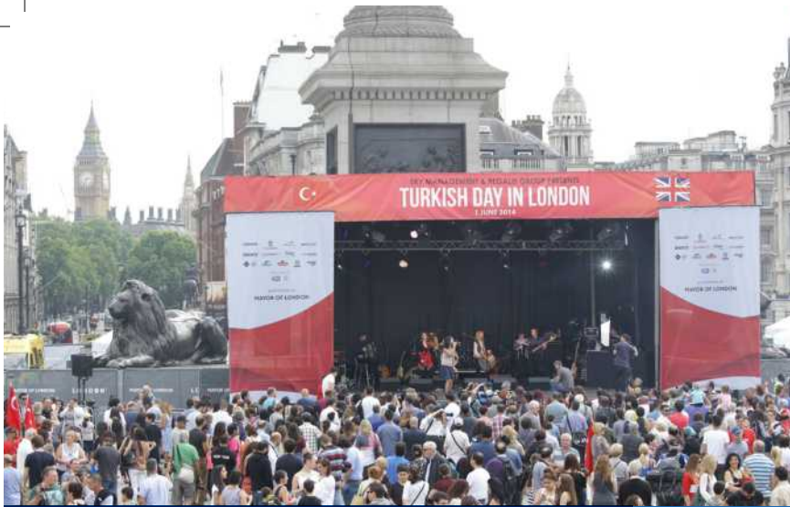
Trafalgar Square, Turkish Day in London Festival