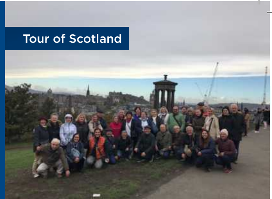
Tour of Scotland