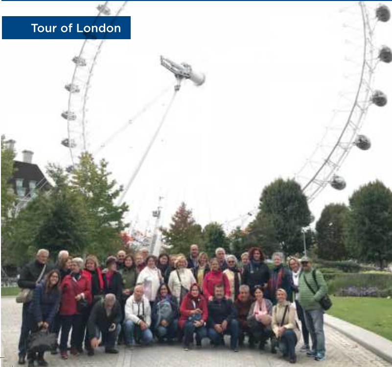
Tour of London