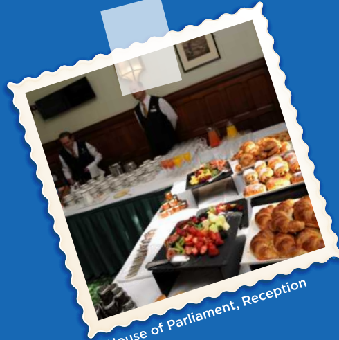
House of Parliament, Reception