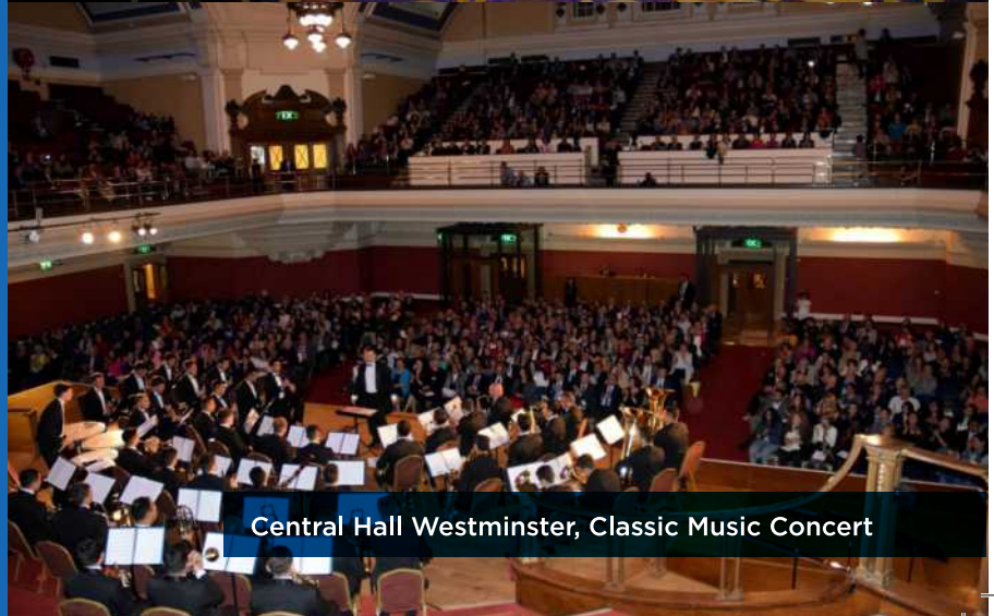
Central Hall Westminster, Classic Music Concert