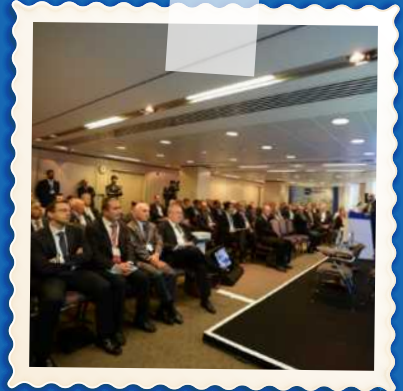
Lancaster Hotel London, Conference