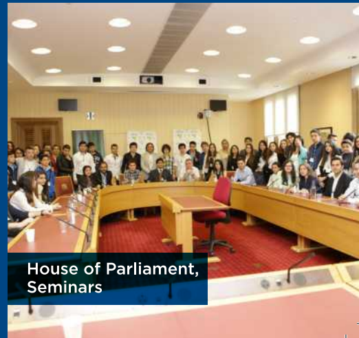
House of Parliament, Seminars