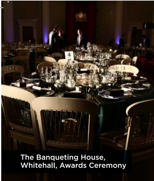
The Banqueting House, Whitehall, Awards Ceremony