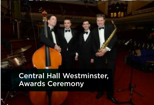
Central Hall Westminster, Awards Ceremony