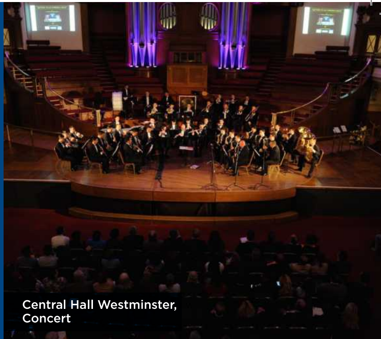
Central Hall Westminster, Concert