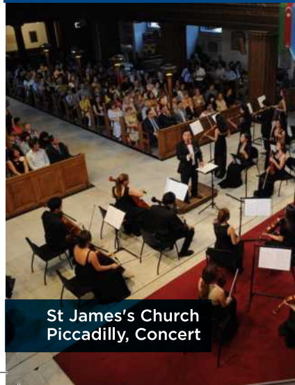
St James's Church Piccadilly, Concert