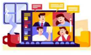
Virtual Events, Webinar, B2B Meetings, Virtual Exhibition